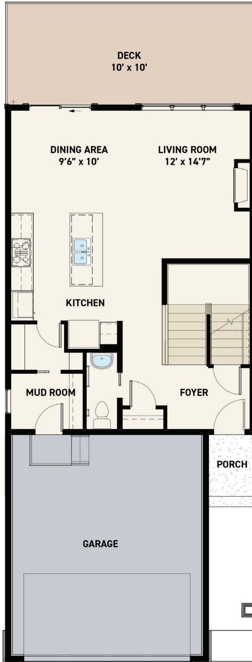
MAIN FLOOR PLAN 768 sq.ft.