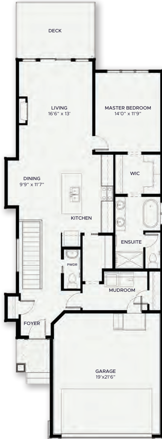
MAIN FLOOR PLAN 1,208 sq ft